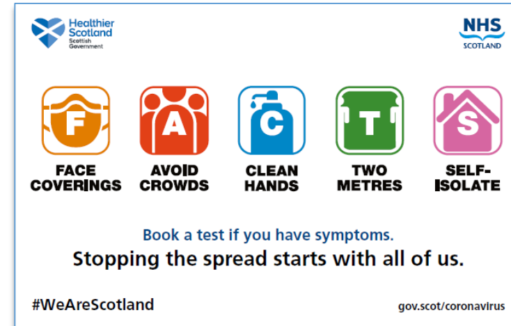
Sample Press Ad